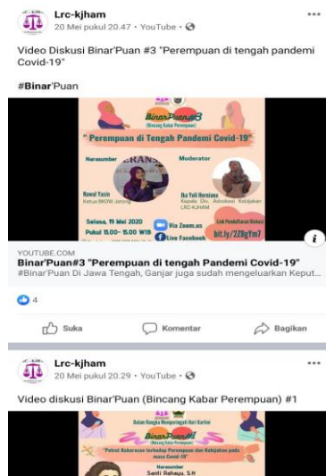
Picture 2. Facebook Account of LRC KJHAM