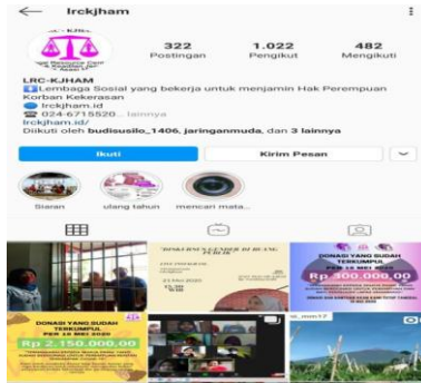
Picture 1. Instagram Account of LRC KJHAM